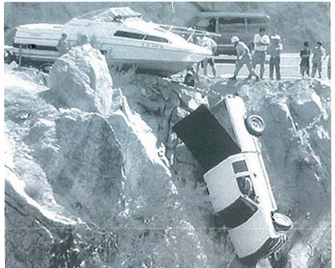
Your newsletter editor would be interested to know just what caption you would put with this picture!