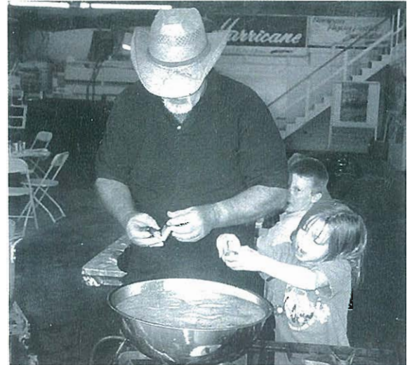
Uncle Bob's Cooking School.