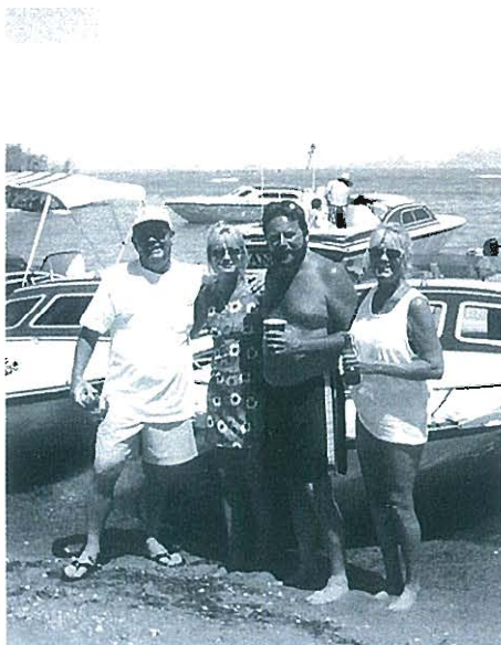
Hope you'll be a part of the 2002 Spring Roundup picture!

It's 80 degrees today and the lemon trees are producing like mad, so it must be time for Cinco de Mayo margaritas and the annual Campbell Spring Roundup. The actual date will be Saturday, May 4 and the event will begin as always with Bloody Marys at the shop. Then we'll "boat up" and meet the rest of the group off the Nautical Inn around 10:30, then take off for our get-together destination. So, throw together some food, drinks and a compatible crew and join us for the official Campbell beginning of the boating season!