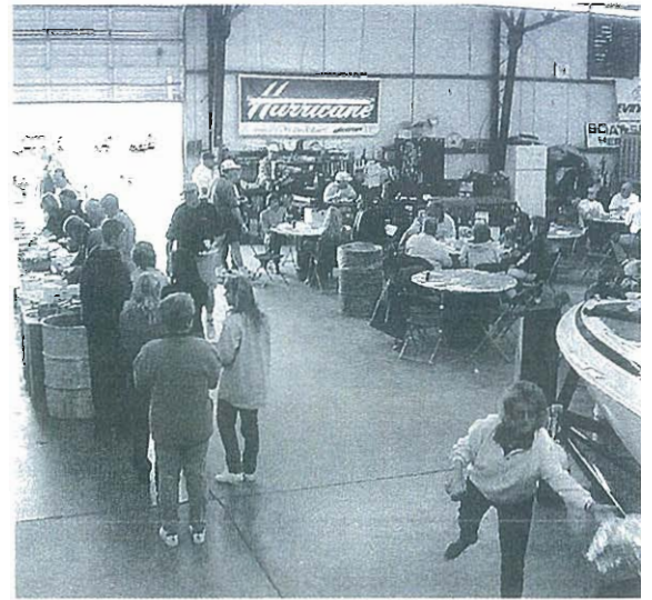
The usual Klambake crowd.